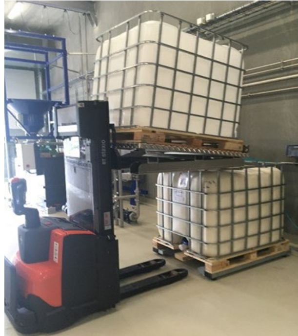
SP-Tilt handled with fog lift