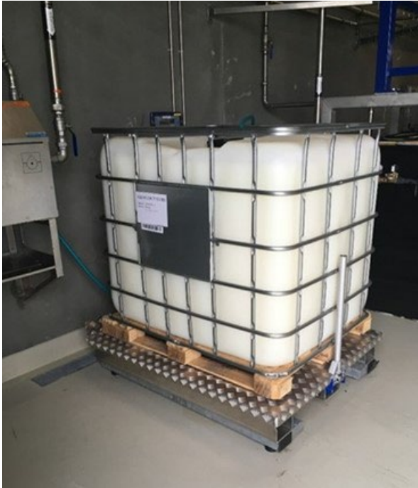
SP-Tilt with pallet tank