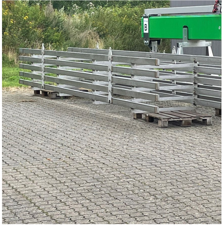
Steel pickling racks, etc.