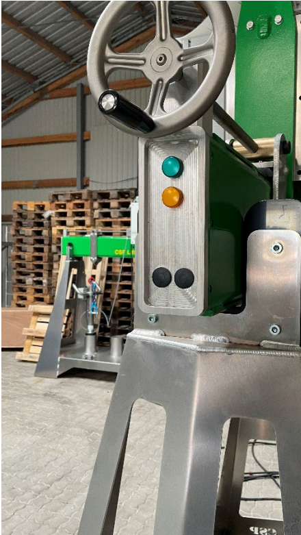
Lifting equipment racks