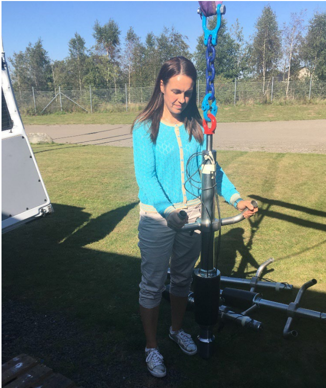
Test of balancing