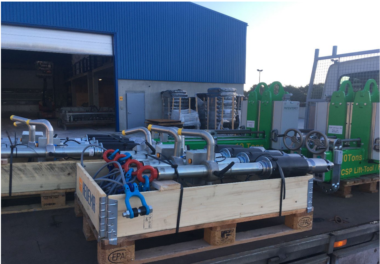
2 sets of lifting yokes (one set of FE1.2M and one set of 2.4A)