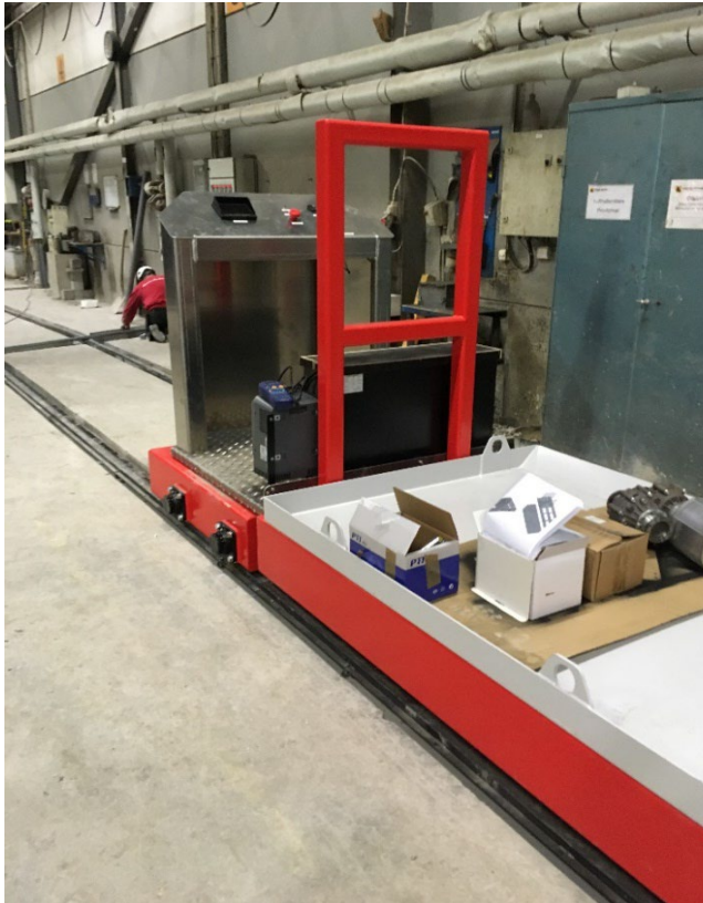
Wagen with two boogies and crates