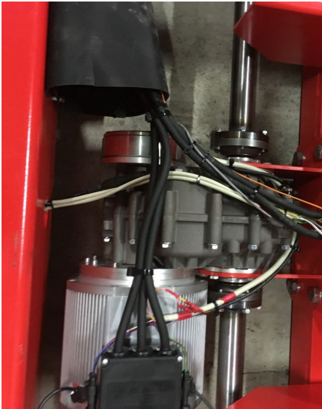
2 pcs. 3000W 24V motors